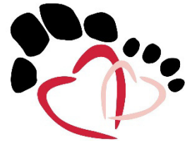
Allandale Veterinary Hospital