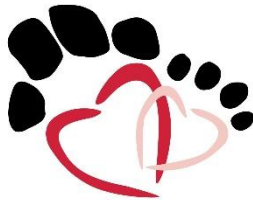
Allandale Veterinary Hospital